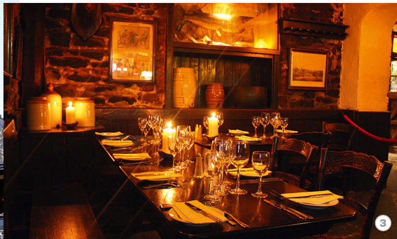
1 Smoked peppered mackerel, one of the delicious products available from the Connemara Smokehouse. 2-3 Carry on the craic at Durty Nelly's Bar and Restaurant in Bunnahatty. 4 A turf fire burns in the hearth of the restored pre-famine cottage at Connemara's Heritage and History Centre.