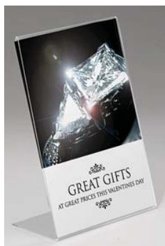
UK Point of Sale

Other companies such as Southern Gem, Noble Gift Packaging, Potters (London) Limited and Pollards International can all provide advice and product suggestions in this area, as can UK Point of Sale, whose acrylic sign holders and cable poster kits are pictured below.