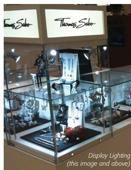
Display Lighting (this image and above)