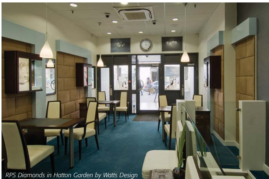
RPS Diamonds in Hatton Garden by Watts Design